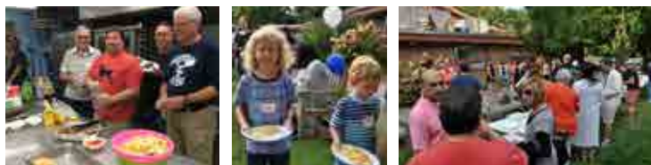
2017 Welcome Back BBQ sponsored by TBA Brotherhood & Sisterhood